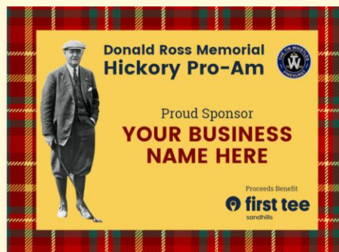
Sample Hole Sponsor Sign

Please email your logo for inclusion on our sponsor banner.